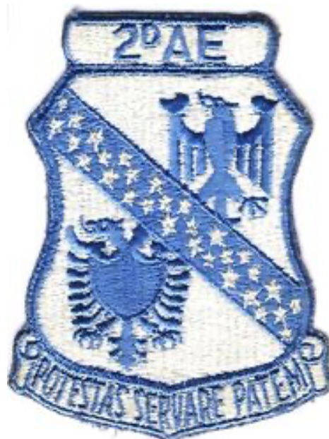
2 Armament and Electronics Maintenance Squadron emblems